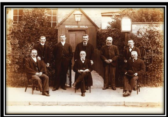
THE TRUSTEES OF THE MISSION IN MAGDALEN ROAD COWLEY

In this talk, a view of a parish in east Oxford, just beyond Magdalen Bridge, will be uncovered as it began to develop after 1850. The first people to live in Cowley St John were mostly artisans, college servants and tradesmen - respectable working-class folk. However, there were pockets of poverty too. Numbers lived only just above destitution and alcohol abuse was common. Christians sought to improve conditions but, across the country, this was an era of significant religious rivalry. Cowley St John was also caught up in a battle for hearts and minds. The ministry of a well-resourced, visionary Church of England vicar will be contrasted with a Nonconformist mission supported largely by the ordinary, middling sort. The latter mission left few lasting traces but closer study has revealed that non-university educated people were often more confident, assertive, and effective in ministry than might be supposed. Struggles experienced by the poor in late Victorian Oxford are glimpsed through the work of both missions