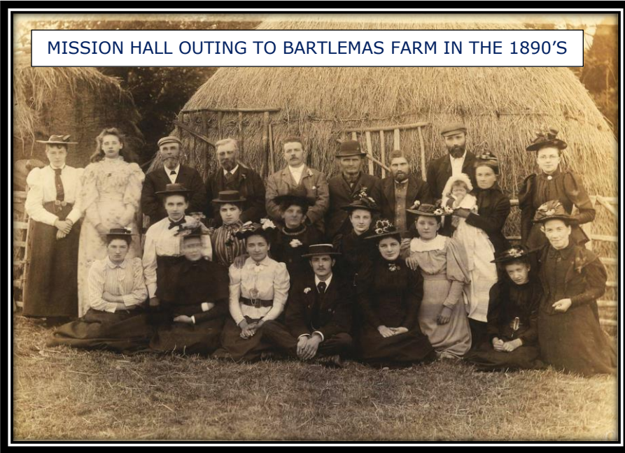
MISSION HALL OUTING TO BARTLEMAS FARM IN THE 1890'S