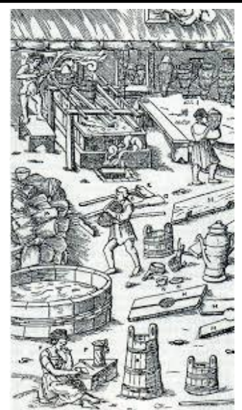
ANCIENT BRITISH SALTERNS IN ACTION