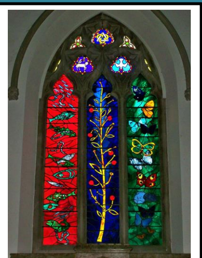
John Piper window at Nettlebed Church