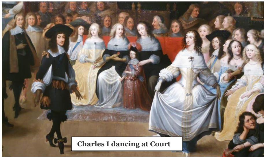
Charles I dancing at Court