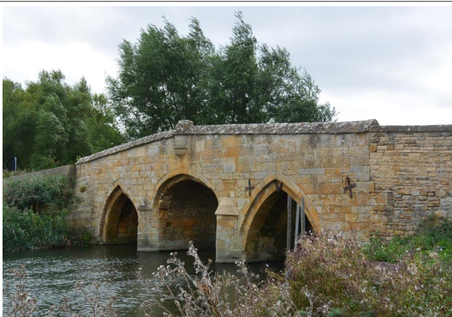
THE OLD BRIDGE AT RADCOT TODAY