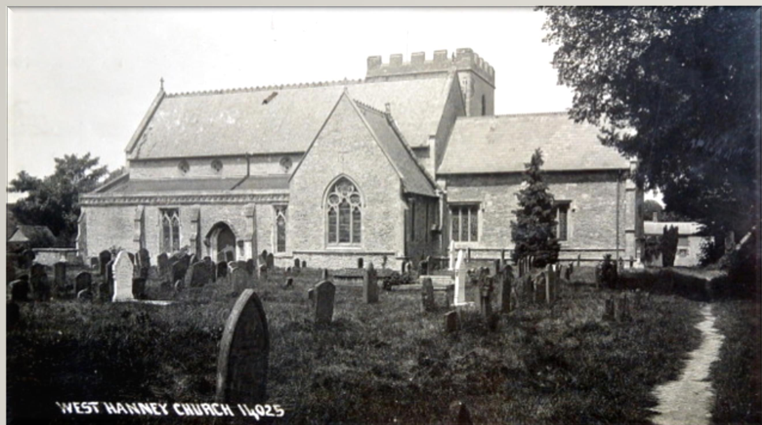
WEST HANNEY CHURCH 114025