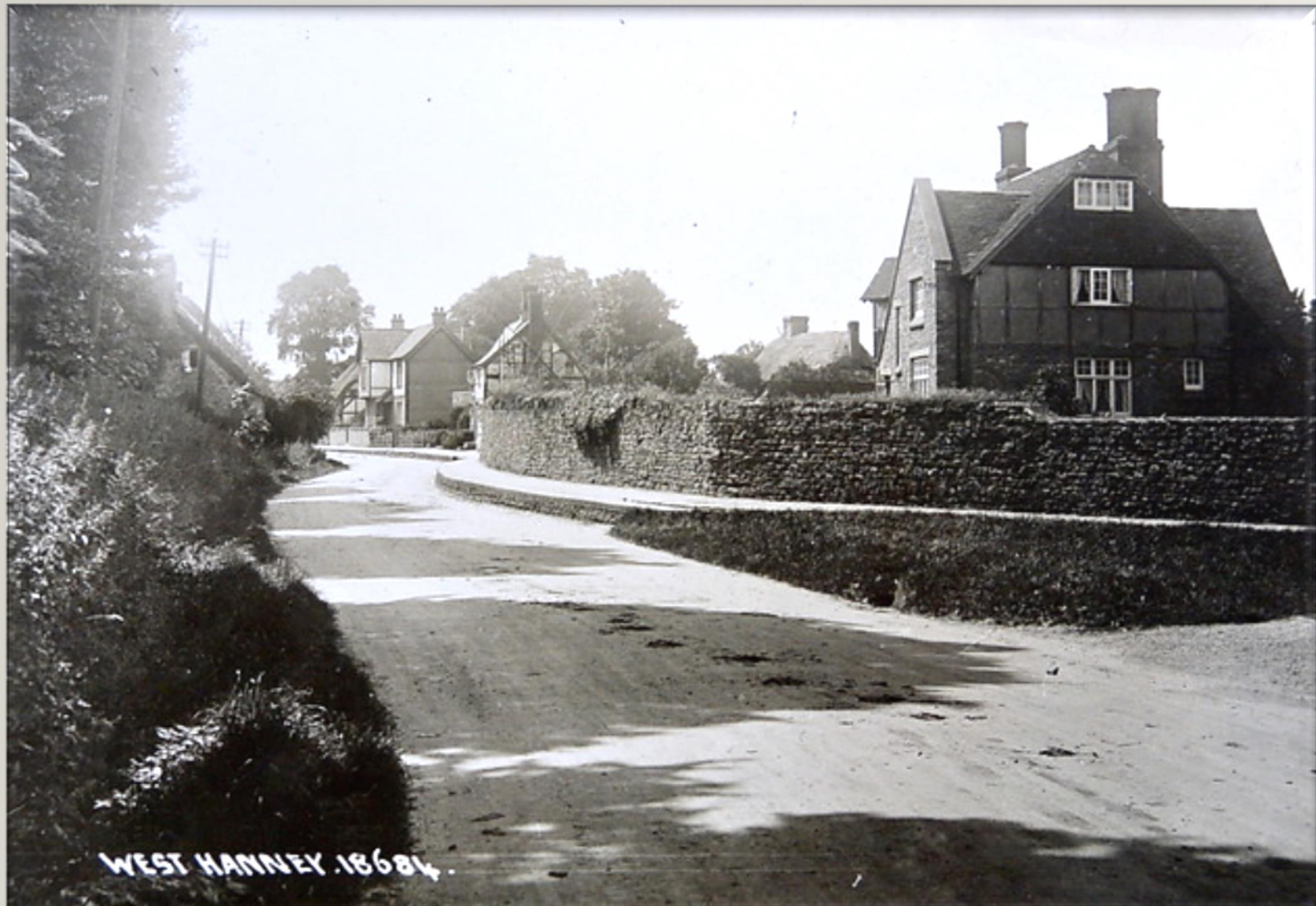
WEST HANNEY 1868.