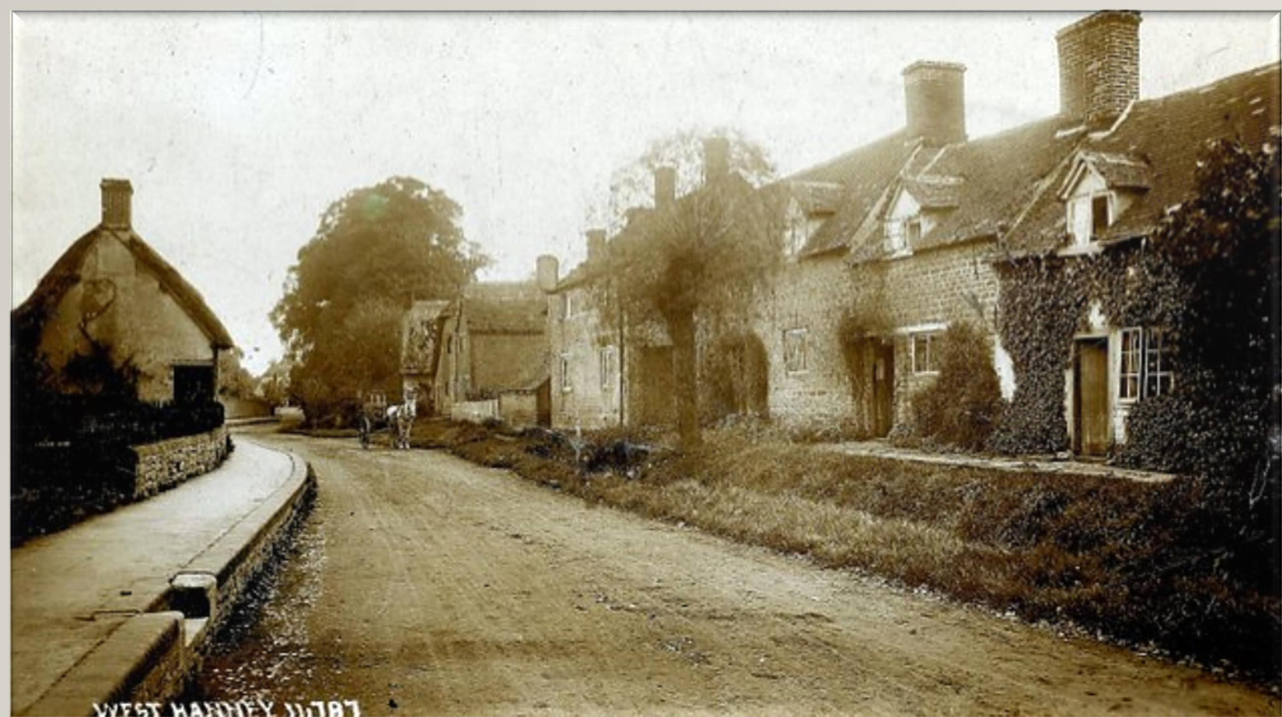
WEST HAMNEY 1871