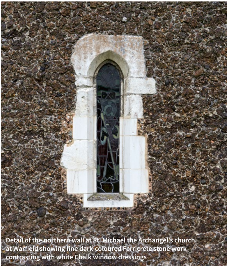
Detail of the northern wall at St. Michael the Archangel's church at Warfield showing fine dark coloured Ferricrete stone work contrasting with white Chalk window dressings

Quaternary Flint occurs in large quantities in Berkshire and is distributed across wide areas of the Downs where it typically occurs as irregularly-shaped nodules on the field surface or in ‘Clay-with-Flints’, or as pebbles in river terrace gravels and other superficial deposits. The size of the nodules ranges from 10-30 cm, although larger nodules occasionally occur. The colour is variable; less weathered flint nodules or pebbles have a cream outer cortex with darker coloured (greyish) interior; weathered flints, in contrast, or those that have lain in soil or superficial deposits for a long period may be variously discoloured or bleached, and often have brown stained interiors due to the precipitation of iron hydroxides from percolating ferruginous