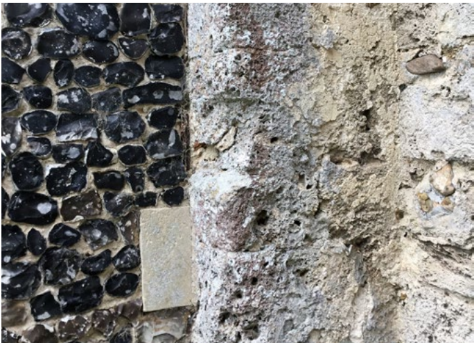
Detail of the southern wall of St. Mary's church at Hamstead Marshall showing blocks of Tufa next to knapped and roughly squared flint

Tufa is soft and crumbly when freshly-quarried, and easily cut into blocks suitable for use as ashlar, but upon exposure to air it hardens to become a useful, more general building stone. It has a very localised and sporadic use as a rubblestone in mediaeval church walls in Berkshire. An example of its use is provided by St. Mary's Church at Hamstead Marshall, near Marsh Benham (illustrated below and on page 12).