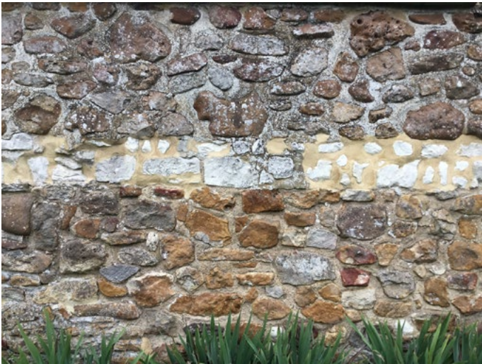
Sarsen Stone employed with Chalk Block, Limes Farmhouse, Upper Lambourn