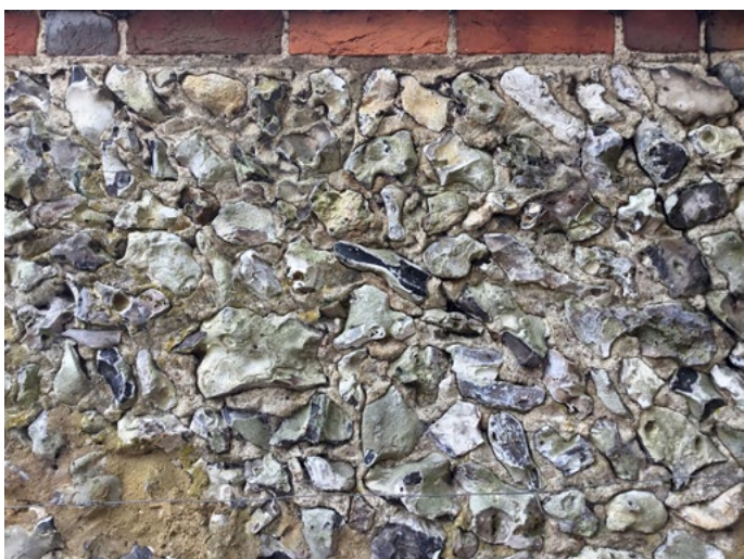
Weathered Downland Field Flint nodules, north east Berkshire