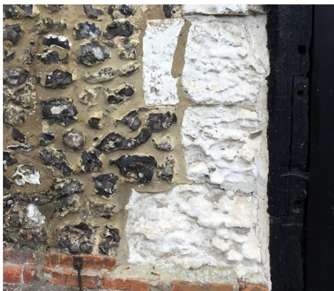
Chalk quoins (containing fresh Flint nodules) adjoining squared and part knapped flint, Monk's Barn, Hurley