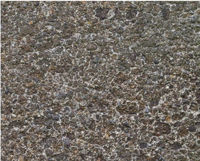
Ferricrete, small blocks and discrete rounded flint pebbles, Church of St. Michael the Archangel, Warfield (see page 18)