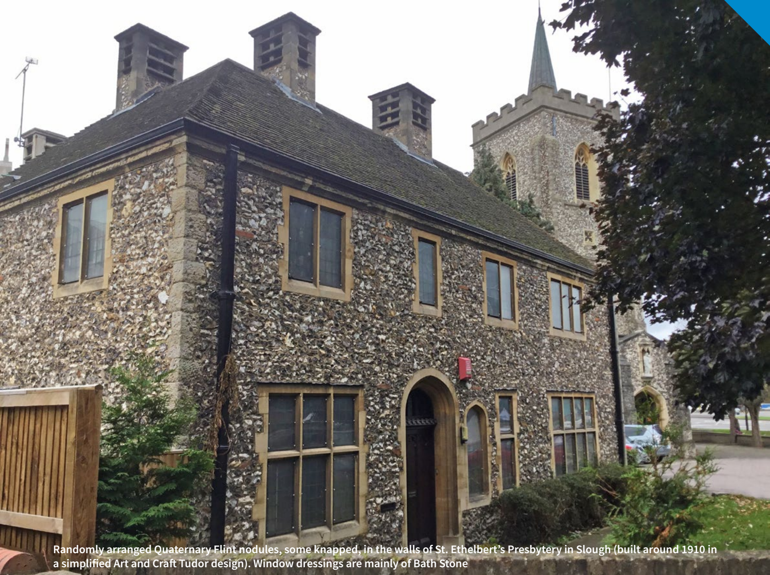
Randomly arranged Quaternary Flint nodules, some knapped, in the walls of St. Ethelbert's Presbytery in Slough (built around 1910 in a simplified Art and Craft Tudor design). Window dressings are mainly of Bath Stone

the most dominant types of building stone used in Berkshire. Many walls and buildings (especially those of churches) throughout the county employ Quaternary Flint in one form or another, and the stone has been used extensively in many towns and villages.