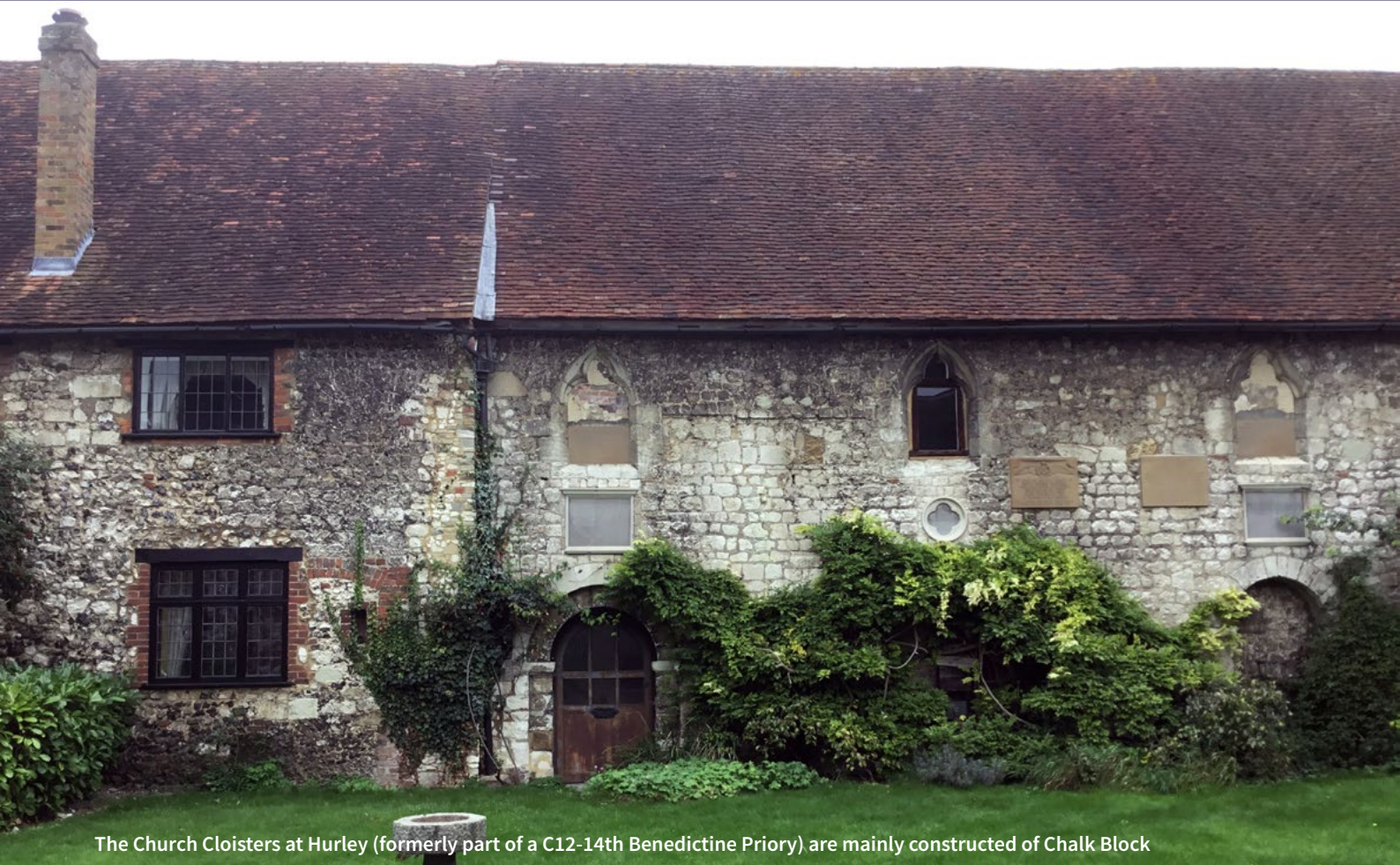
The Church Cloisters at Hurley (formerly part of a C12-14th Benedictine Priory) are mainly constructed of Chalk Block