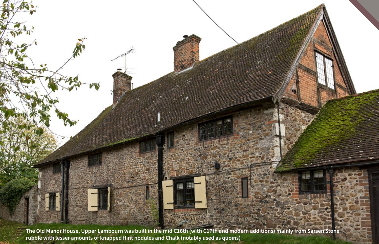
The Old Manor House, Upper Lambourn was built in the mid C16th (with C17th and modern additions) mainly from Sarsen Stone rubble with lesser amounts of knapped flint nodules and Chalk (notably used as quoins)