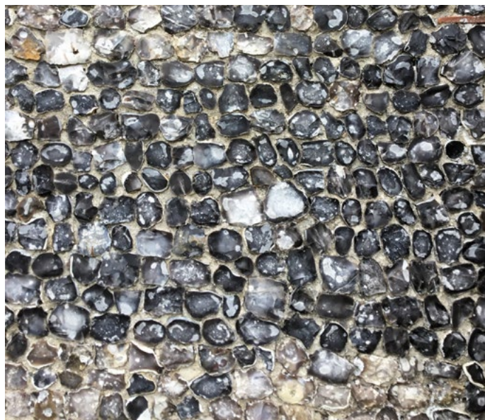
Roughly squared, knapped Flint blocks and nodules, St. Mary's Church, near Hamstead Marshall