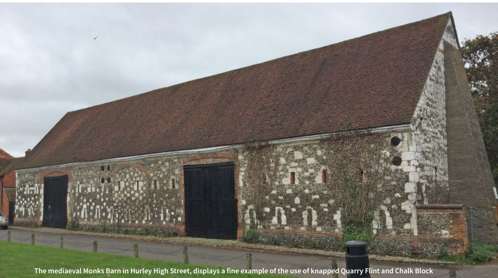
The mediaeval Monks Barn in Hurley High Street, displays a fine example of the use of knapped Quarry Flint and Chalk Block

The extremely hard and resistant nature of Quarry Flint nodules has resulted in their having been recycled by natural processes into younger deposits, where they show specific characteristics - these types of flint are described in the Quaternary section of this Atlas below.