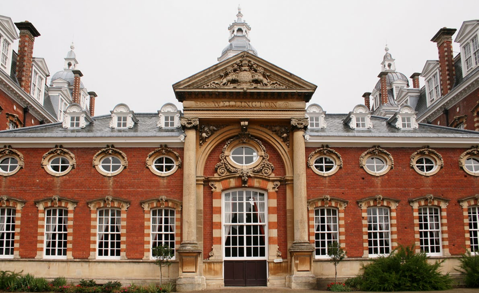
The impressive C19th entrance of Wellington College, near Crowthorne, Bracknell Forest, constructed from red brick and Bath Stone