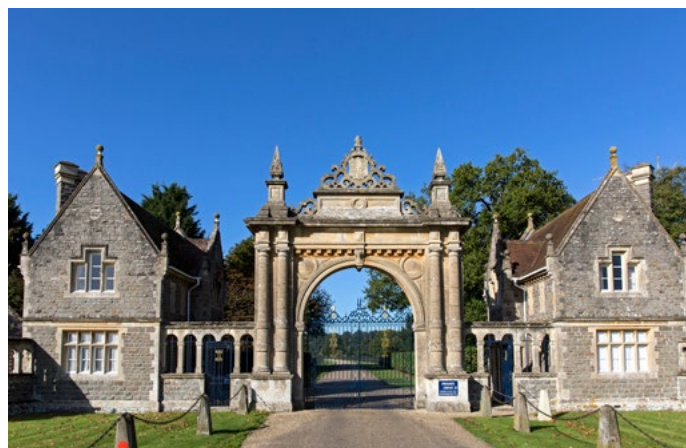
Above: East Lodges and Gateway to Englefield Park near Theale, built in 1862 of snecked, rock-faced Pennant Sandstone and Bath Stone

Grey or rusty-brown lithic sandstones, often with coaly flecks or streaks. Iron-staining develops upon weathering, often being concentrated along joints. Found mainly in the southern parts of Berkshire, notably in association with the Great Western Railway and Kennet and Avon Canal. Used as randomised or coursed, snecked, rock faced blocks in a cluster of churches and chapels in the Maidenhead-Reading area, for entrance gateways and lodges (e.g. Englefield Park) and as decorative squares or hexagonal blocks in flintwork in church walls. Pennant Sandstone was also widely used for church steps and door sills, as well as for kerbing, guttering and flagstones.