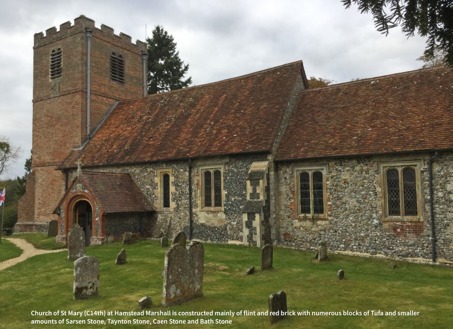
Church of St Mary (C14th) at Hamstead Marshall is constructed mainly of flint and red brick with numerous blocks of Tufa and smaller amounts of Sarsen Stone, Taynton Stone, Caen Stone and Bath Stone

is used as roughly shaped and faced blocks with flint nodules and red brick along with minor amounts of Sarsen Stone, Chalk, Caen Stone and Bath Stone.