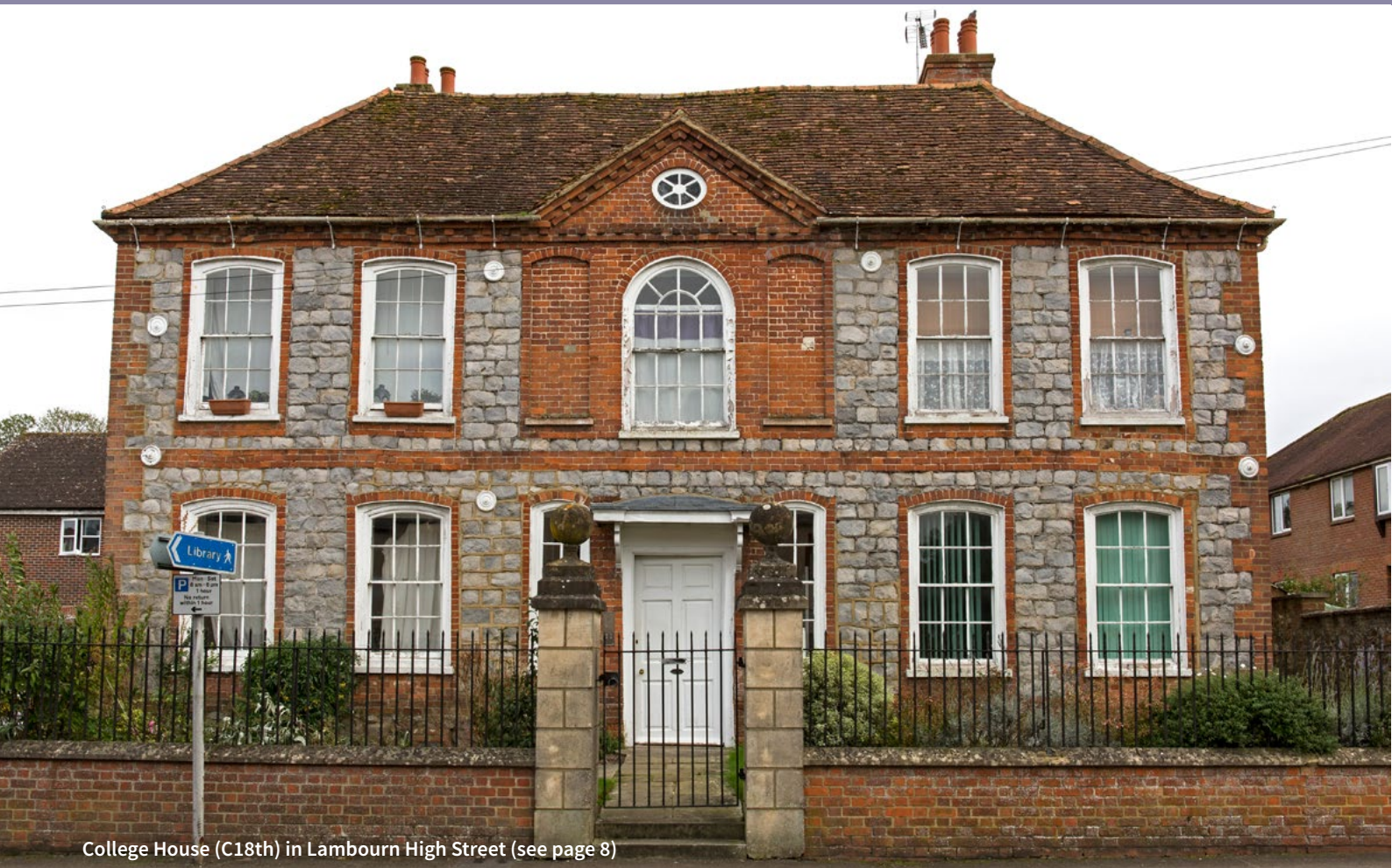
College House (C18th) in Lambourn High Street (see page 8)