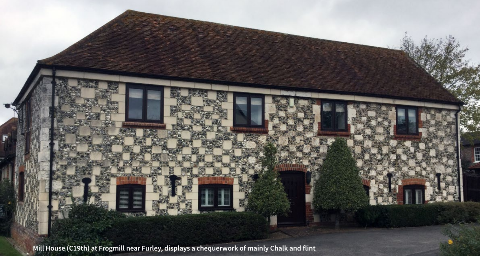
Mill House (C19th) at Frogmill near Furley, displays a chequerwork of mainly Chalk and flint

ruins which also contain Caen Stone, although often only the flint rubble cores of the walls remain. At least some of the flint used at Reading Abbey is likely to have been sourced from the nearby Chiltern Hills in Buckinghamshire or south Oxfordshire.