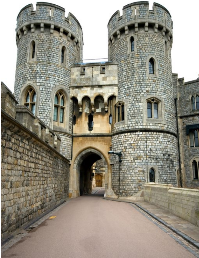
Above: The Norman Gate leading to the Upper Ward of Windsor Castle, constructed mainly from Sarsen Stone ('Bagshot Heath Stone'), with some Kentish Ragstone, Caen Stone and Bath Stone

The bulk of the stone was brought to Windsor along the Thames, although C14th records note that some of the stone was quarried underground beneath the North Downs (e.g. Reigate Stone). Surviving records also refer to the "... bringing by ox- or horse-drawn carts overland of Totternhoe stone" from quarries north of Windsor on the edge of the Chiltern Hills near Leighton Buzzard. In the C19th Sarsen Stone was supplied from High Wycombe in Buckinghamshire. A quantity of Sarsen Stone was also obtained for wall repairs in 1939 from the Upper Kennet Valley quarries in Wiltshire.