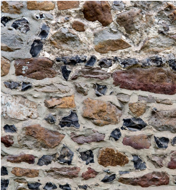
Partly dressed Sarsen Stone with roughly knapped Flint nodules, Old Manor House, Upper Lambourn (see page 17)