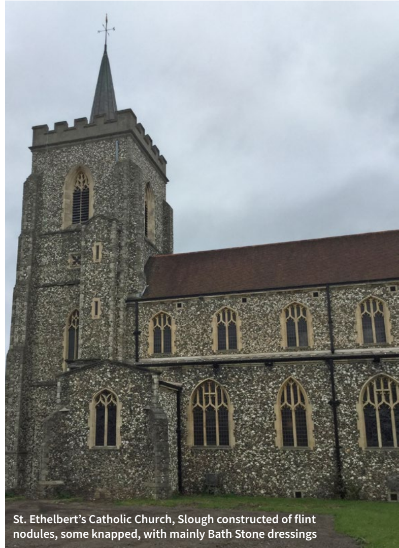
St. Ethelbert's Catholic Church, Slough constructed of flint nodules, some knapped, with mainly Bath Stone dressings

In the C18th and C19th a comparatively large number of new Anglican and Roman Catholic churches and Non-conformist chapels were built to serve the spiritual and social needs of the rapidly growing population. The Classical and Gothic Revivals of the C18th and C19th, combined with improved transportation, led to the importation of a wide range of stone from sources outside the county. In particular, architects of the High Victorian Gothic Revival, from the 1850s on, favoured flint, (such as in St. Peter's Church, Chavley, designed by G. E. Street and built in 1860-61) and the use of elaborate ornamentation, colour and textual contrasts using a wide variety of imported building stones. The use of flint as a favoured building stone continued into the early C20th, as seen for example in St. Ethelbert's Catholic Church, Slough, built in 1909-10.