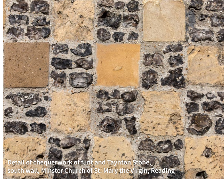
Detail of chequerwork of flint and Taynton Stone, south wall, Minster Church of St. Mary the Virgin, Reading

Churches are the most frequent examples of surviving mediaeval buildings in which indigenous stone is used extensively. They are predominantly constructed of flint, with Chalk and Sarsen Stone also being employed in the western downland area. A few Ferricrete and flint churches occur in the east and here the stone may often have originated from sources outside the county. The long history of alteration, extension, rebuilding and repair of such churches means they frequently exhibit a range of stone of different origins and periods.