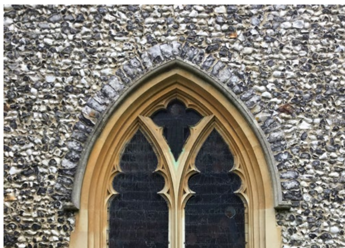
Different styles of flint in wall and above lancet window (squared blocks), All Saints' Church, Binfield