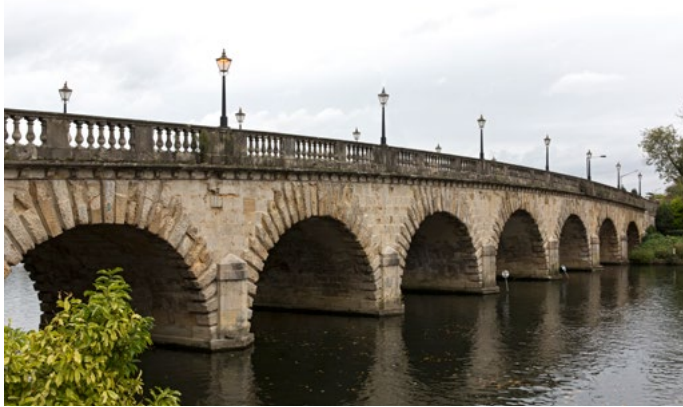
Above: Maidenhead Road Bridge over the River Thames was first opened to traffic in 1777. It is built of Portland Stone ashlar, vermiculated in places with moulded cornice and balustrade