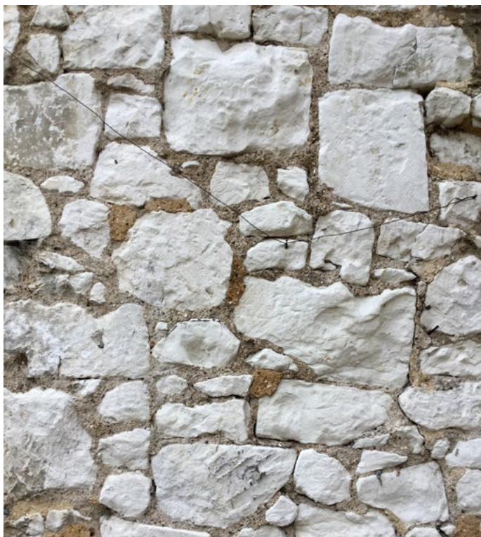
Squared and randomised Chalk Block, Church House, Hurley