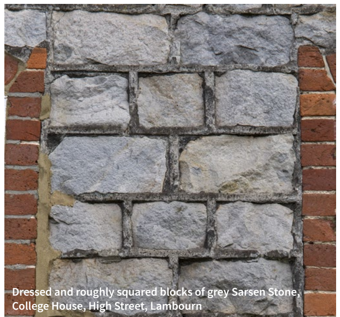
Dressed and roughly squared blocks of grey Sarsen Stone, College House, High Street, Lambourn

Berkshire displays a diverse range of stones and styles of use in walls across the county. A representative (but not exhaustive) selection of these relating to indigenous building stones are illustrated in the following pages.