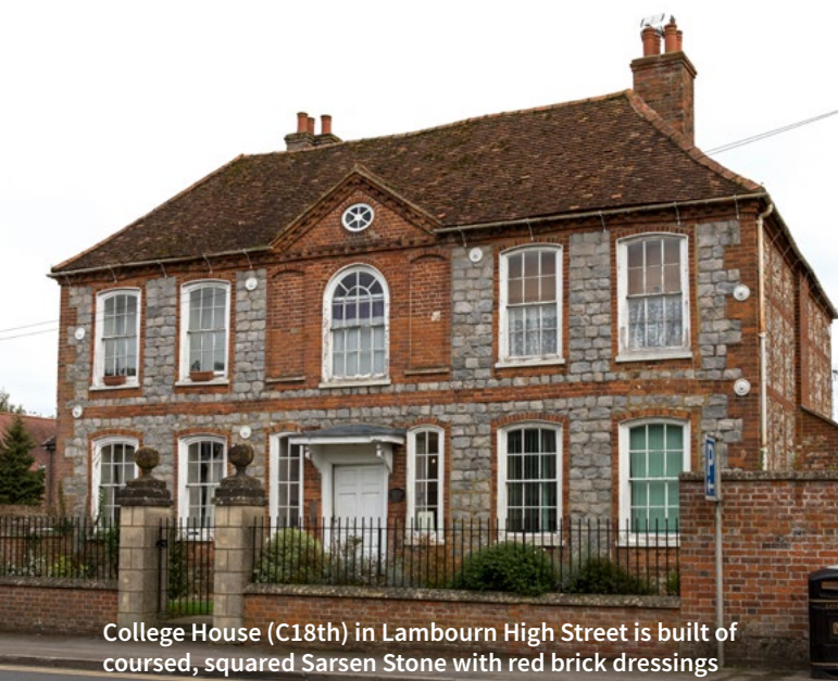
College House (C18th) in Lambourn High Street is built of coursed, squared Sarsen Stone with red brick dressings

Historically, timber frame was dominant, with brick and/or flint fill used in numerous smaller houses and farm buildings post-C17th. Pre-1750 farmstead buildings were typically of loose courtyard plan with timber-framed barns, including aisled barns and cattle housing. Many of the C19th farmsteads were built in brick with occasional use of flint in their plinth walls; they are often arranged in regular courtyard complexes. Flint was used in the C2nd Roman villa at Cox Green, Maidenhead and as the rubble core of the walls of buildings in Reading Abbey, which was founded by Henry I in 1121. The much-restored Abbey Gate and the Hospitum survive together with extensive