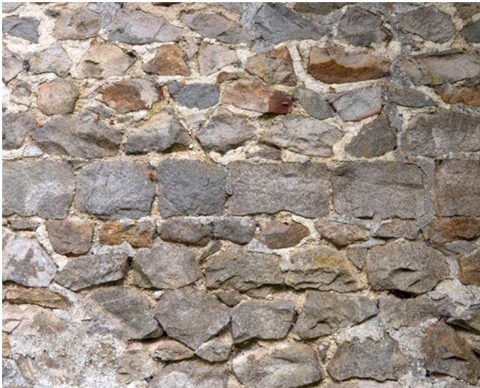
Sarsen Stone, some blocks dressed and roughly shaped, High Street, Upper Lambourn