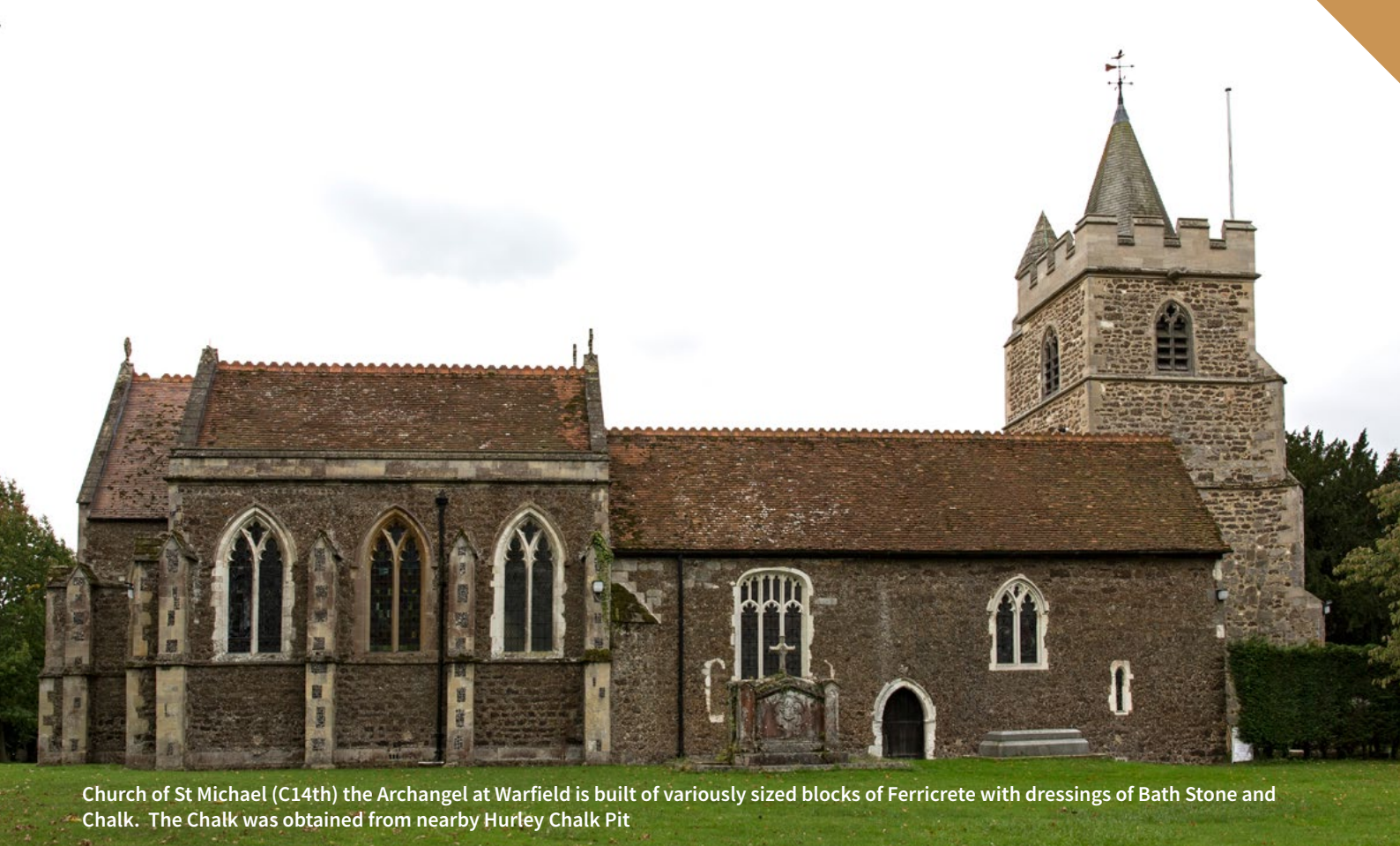
Church of St Michael (C14th) the Archangel at Warfield is built of variously sized blocks of Ferricrete with dressings of Bath Stone and Chalk. The Chalk was obtained from nearby Hurley Chalk Pit

Forest and Slough. It is typically employed as irregular, crudely dressed blocks in walls and is often accompanied by roughly-trimmed flints and Sarsen Stones. It is seen in a variety of walls, including those of churches and other old buildings, but also occurs in farm-yard and garden walls. Particularly good examples of its use are provided by the churches at Binfield, Bucklebury, Waltham St. Lawrence, Warfield and Winkfield, and the round towers of Welford and Great Shefford churches. The tower of All Saints Church at Wokingham formerly exposed a superb example of Ferricrete stonework, but has since been extensively rendered.