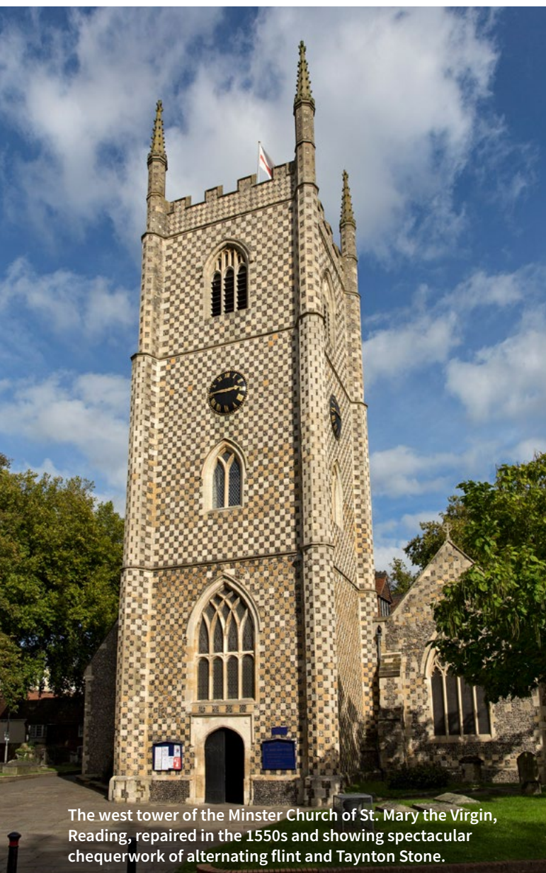
The west tower of the Minster Church of St. Mary the Virgin, Reading, repaired in the 1550s and showing spectacular chequerwork of alternating flint and Taynton Stone.

Timber frame construction of farm buildings predominated well into the C19th. The form of barns changed little between the mediaeval period and the age of stream threshing. Aisled construction was used for many of the earliest barns, particularly in south Berkshire. Such barns frequently used indigenous stone in the footings and plinths, including flint, Sarsen Stone, Chalk and Ferricrete. Large, un-aisled timber frame barns or brick and flint combination barns became dominant in the downland areas enclosed from the later C18th. Many