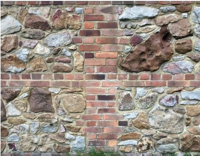
Sarsen Stone, large unworked blocks used randomly in modern wall with bricks, near Place Farmhouse, Lambourn