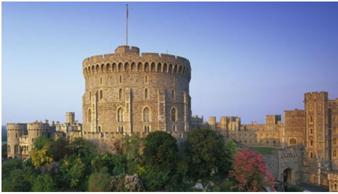
Above: Skyline view of Windsor Castle