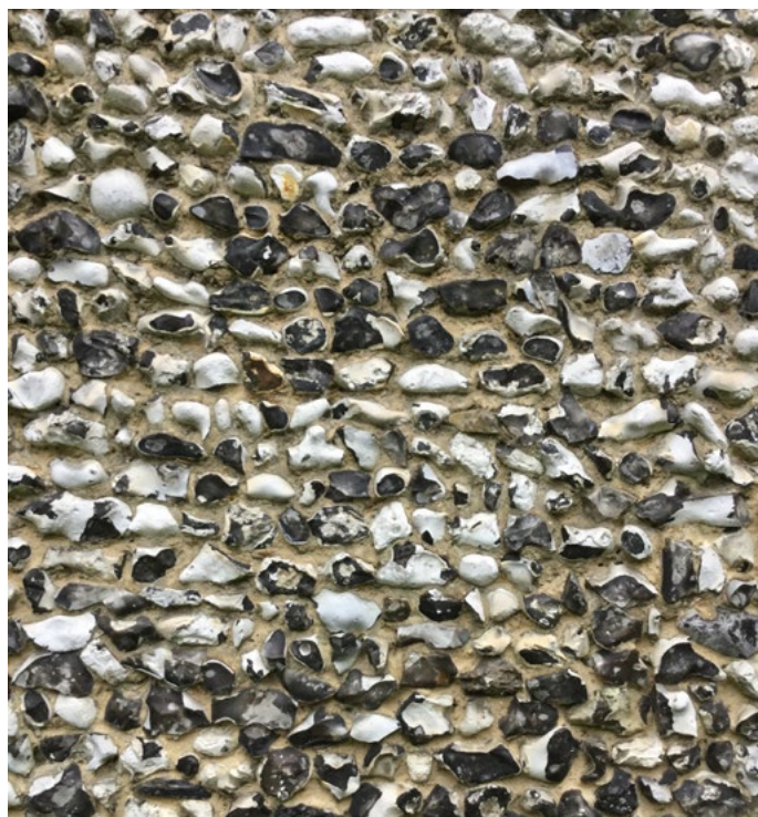
Flint nodules, some knapped, All Saints Church, Binfield