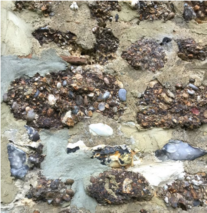
Ferricrete, large randomly-shaped to roughly lenticular blocks, All Saints' Church, Binfield