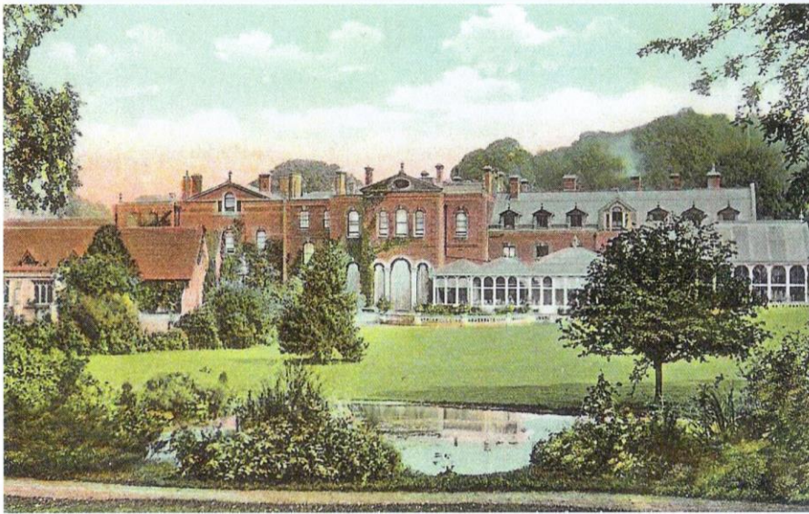
Lockinge House from the south.